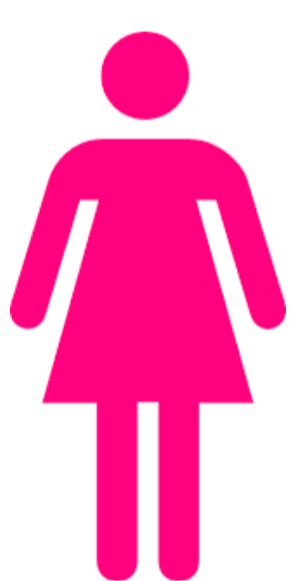
Incidence rate in female