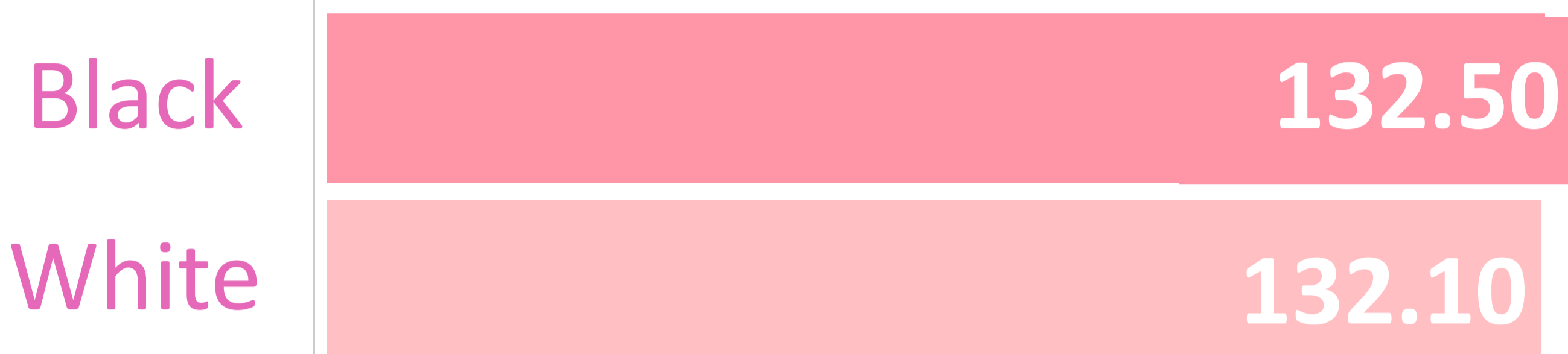
Death rate by Race