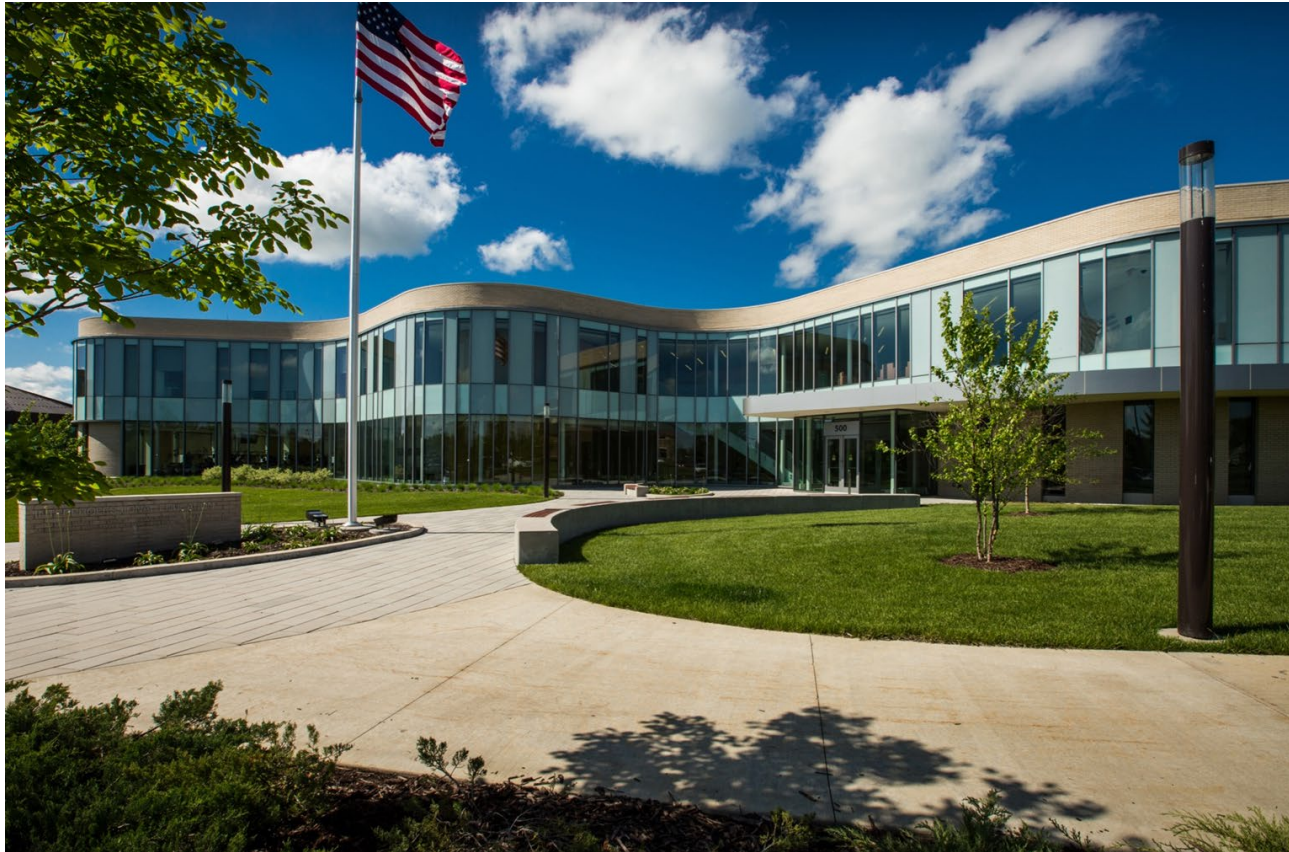
Interprofessional Education Building