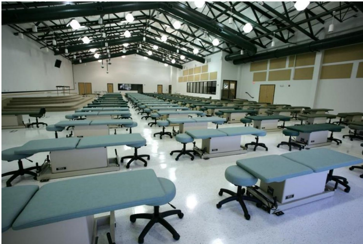
Blumenthal Osteopathic Skills Lab