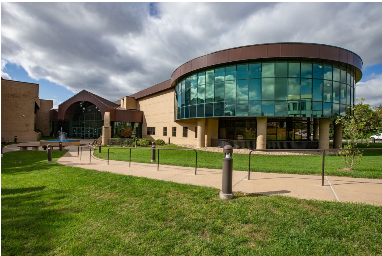
Connell Information Technology Center