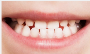
No Obvious Problem