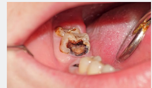
Urgent Dental Care

This project is/was funded in part by the Missouri Department of Health and Senior Services Title V Maternal Child Health Services Block Grant and is/ was supported by the Health Resources Services Administration (HRSA) of the U.S. Department of Health and Human Services (HHS) under grant #B04MC47428, Maternal and Child Health Services for $12,834,718, of which $0 is from non-governmental sources. This information or content and conclusions are those of the author and should not be construed as the official position or policy of, nor should any endorsements be inferred by HRSA, HHS or the U.S. Government.