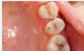
Early Dental Care