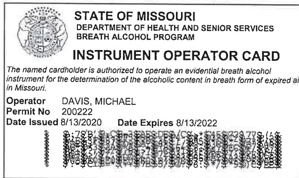
DIRECTOR OF DEPARTMENT OF HEALTH AND SENIOR SERVICES