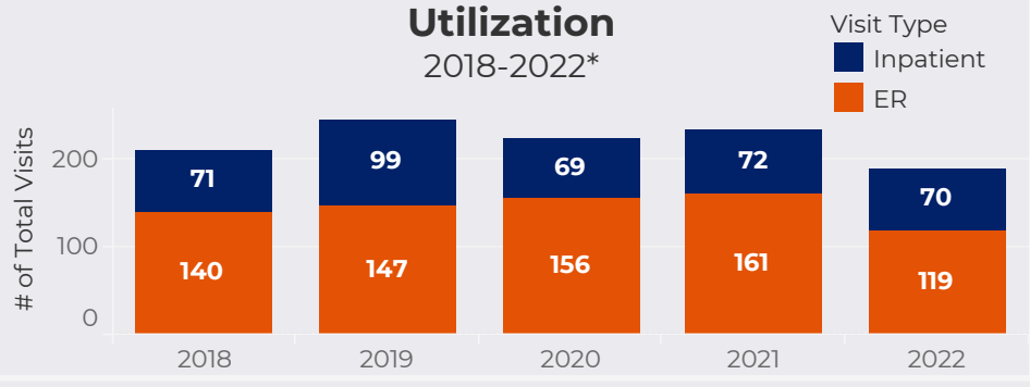
Figure 1. Nonfatal All Drug Overdose Health Care