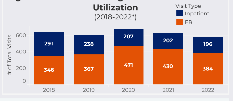
Figure 1. Nonfatal All Drug Overdose Health Care