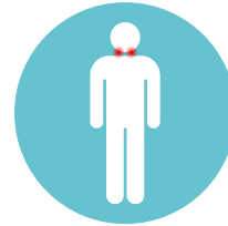
SWOLLEN LYMPH NODES