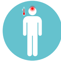
FEVER & HEADACHES

Early signs may include fever, malaise (a general feeling of discomfort), headache, swollen lymph nodes, and sometimes cough or sore throat. Other symptoms include muscle aches, backache, chills, and exhaustion, followed by a rash that typically begins on the face and spreads to other parts of the body.