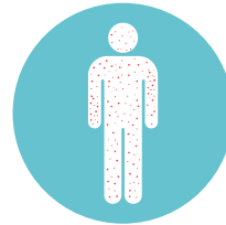
RASH, BUMPS, OR BLISTERS