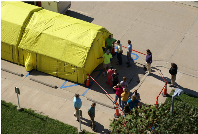
MSPHL staff receive instructions before passing through the decontamination tents.

The exercise effectively tested the response of the MSPHL to this type of incident. The procedures within the EOM seemed genuinely effective in getting staff out of harm's way through quick actions and collaboration with those outside entities who were there to assist. That is not to say, however, that there are not lessons to be learned. Communication was generally successful. Updates to staff were given on a regular basis and all staff were directed to safety.