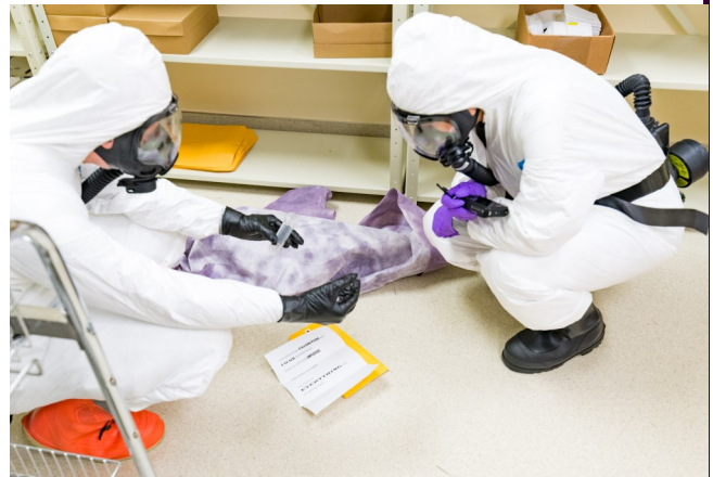
Members of the Federal Bureau of Investigation and 7th Civil Support Team work together to collect samples.

The MSPHL utilized seven observers to evaluate and record the events of the exercise. Each was trained in advance, made aware of expectations, and provided evaluation forms that included staff expectations ranging from physical actions to communications. Observers were able to document when messages were received or sent, when actions were completed and any unexpected events, questions, comments or concerns. Once completed, these forms were submitted to the LPES Unit for review to assist with identifying gaps and making updates to the EOM.