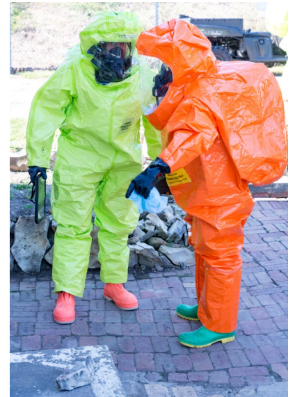
Cole County Hazmat Team prepares to run MSPHL staff through decon.

Due to the nature of the exercise the MSPHL response, specifically the evacuation, was heavily reliant on guidance from outside partners who have specific plans in place for building evacuations. The unified command had open lines of communication with each of the responding agencies, as well as laboratory leadership. Laboratory staff took shelter in safe zones that are clearly defined in the EOM and remained in those areas until they received proper guidance from the unified command. During the shelter time the Cole County Hazmat team, in coordination with the FBI and Jefferson City Fire Department, assembled their decontamination tents at the front of the laboratory to simulate a true building evacuation. All laboratory staff were given the opportunity to pass through the decontamination tents and instructed inside the tent what their expectations would be in a real event. Members of the Department of Mental Health were also staged at the entrance to the tent as well as the exit, to assist staff that may be incurring any mental stress.