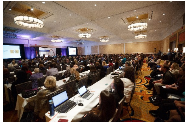
The 2016 Newborn Screening and Genetic Testing Symposium was held in St. Louis, Mo. Several members of the MSPHL attended and assisting in planning the meeting. MSPHL also hosted a laboratory tour of its facility during the conference.

APHL has throughout its existence benefited all public health laboratories, public health and the citizenry by focusing on public health policy and building laboratory capabilities. If you haven't done so yet, visit them at www.aphl.org .