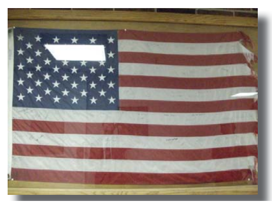
Flag that survived the devastating tornado that hit Stockton on May 4, 2003