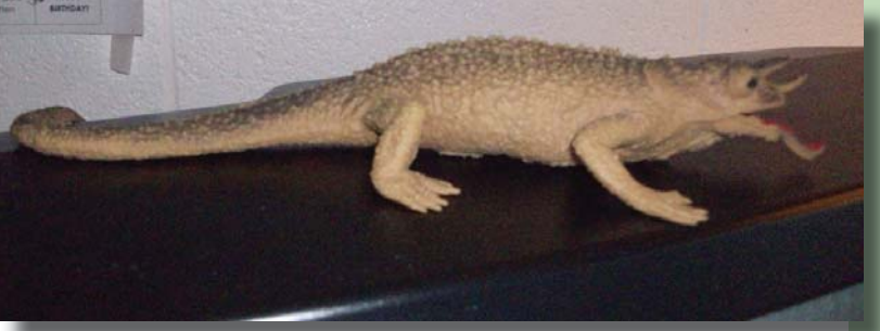
Resident Fox's rubber lizard, used to play pranks on staff