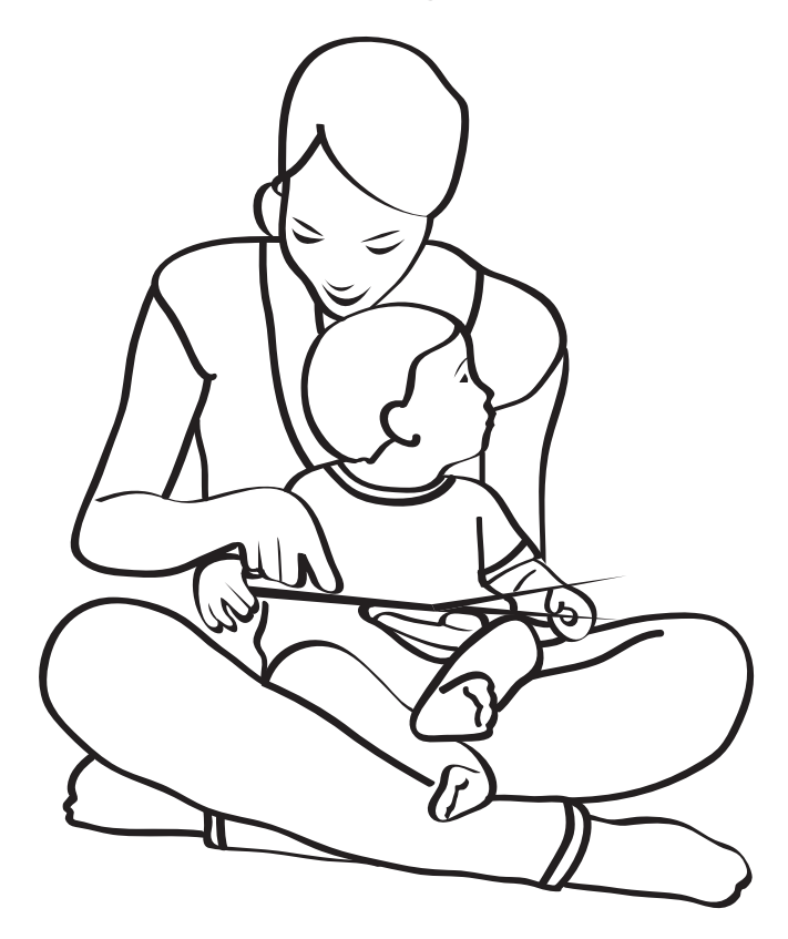
Learning New Information