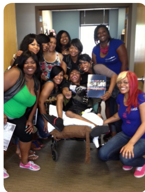
Above: The Heavenly Angels of Kansas City, a parent group, who spent a Saturday helping us prepare Welcome packets for new families!

There are many ways you can partner to meet the needs of your family and help others at the same time. You can become more involved by volunteering in community activities, talking to other parents or people with special health care needs/developmental disabilities as a peer mentor, and participating in school organizations, on focus groups, or on local advisory boards. All of these activities can introduce you to new people who may become friends and make a difference for yourself or someone like you. MOF2F can help you channel your passion and find the right opportunity. Connect with us online at mofamilytofamily.org to attend the Family Leadership Series or find out how you can help us make a difference for families in Missouri! ●