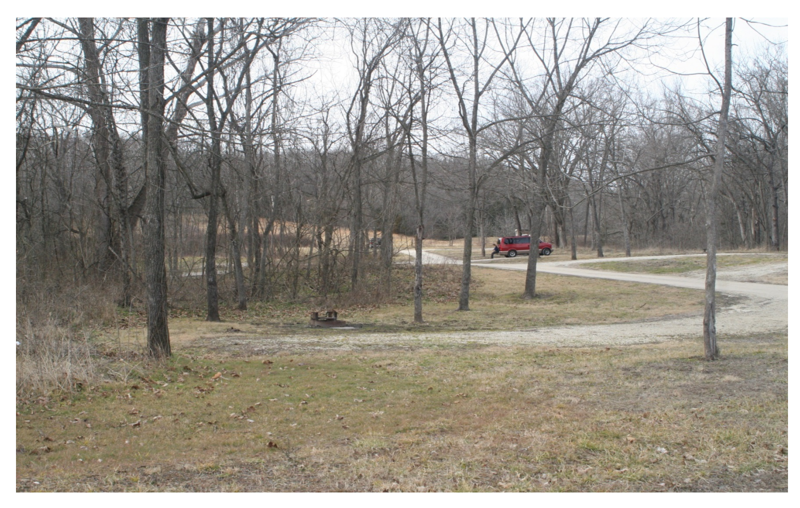
Figure 4 Saline Valley Conservation Area Campground Looking Northwest – January 30, 2012