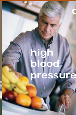
high blood pressure