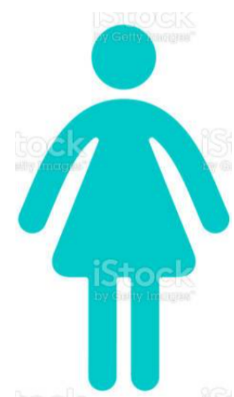
Incidence rate in Female